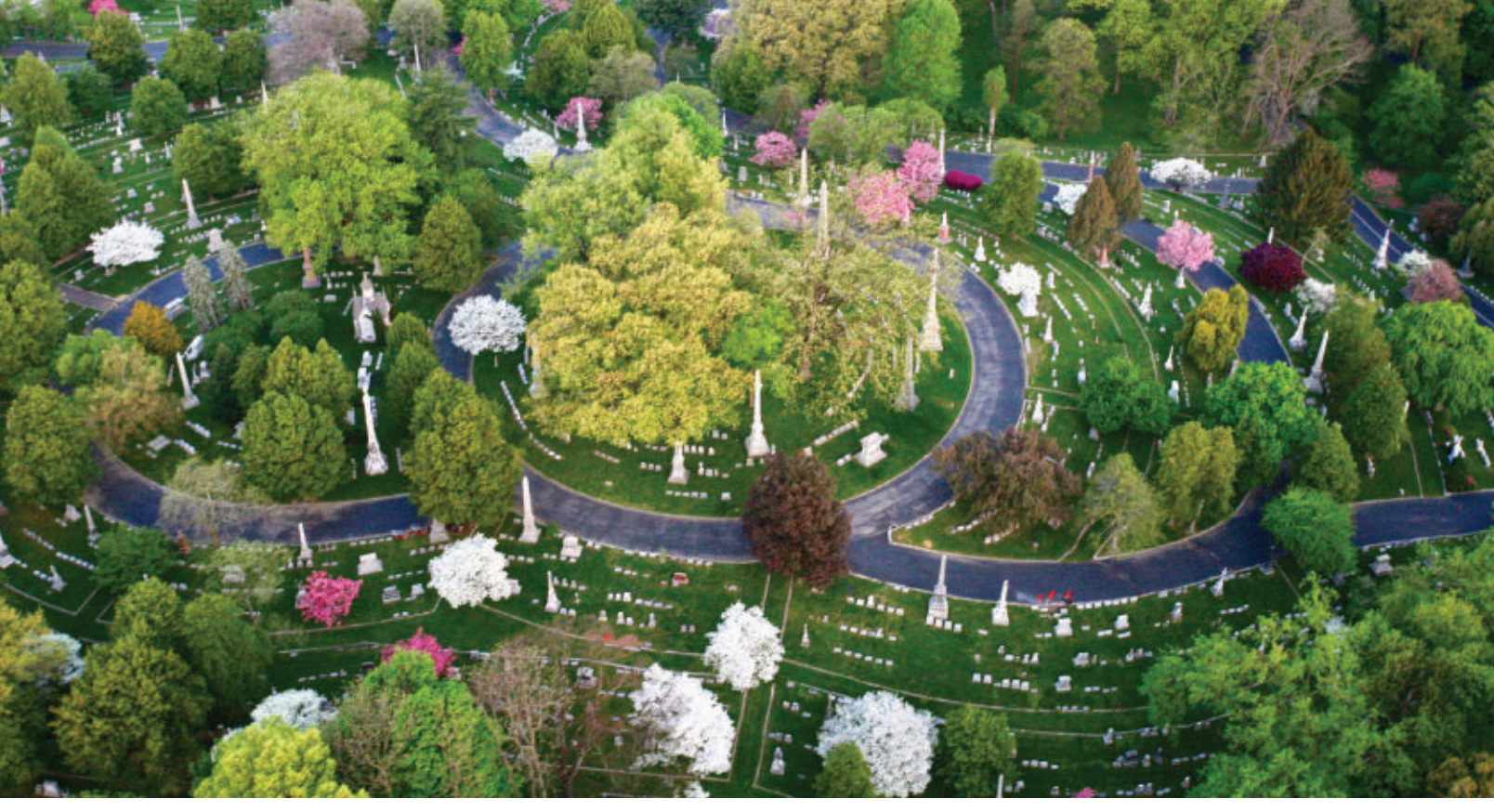
An aerial overview of Cave Hill Cemetery's 296 acres. Opposite page: The historic "Henry Clay Ginkgo Tree" is located in Section N at Cave Hill Cemetery.