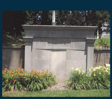
Kempe mausoleum AFTER restoration