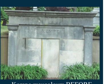
Kempe mausoleum BEFORE restoration