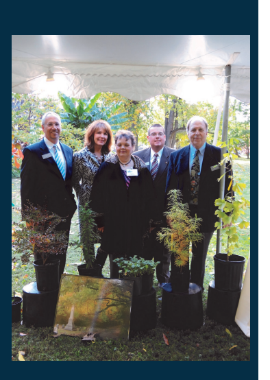
Cave Hill Cemetery staff members at a reception in the cemetery.