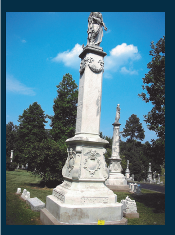
Hikes monument AFTER restoration