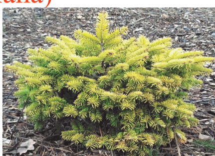
to the green landscape.

We have the common variety at Cave Hill; and, just last Fall, I bought the Golden Spreader, which came to us