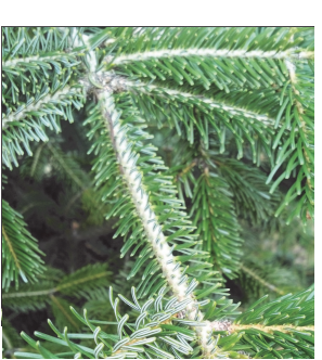
The foliage is a highlight of the Nordman Fir.

finger pricks so common with spruce and pine. Its wood is used for construction and it is planted all over Europe in gardens and on large estates. It is rarely seen in Kentucky.