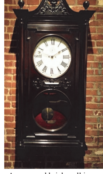
An exposed brick wall is a suitable backdrop for the clock.

pleased to share these pieces with the public, and to assist Bittner's and the Frazier Museum in making their exhibit complete.