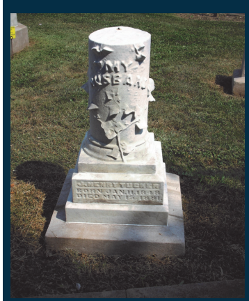
Tucker monument AFTER