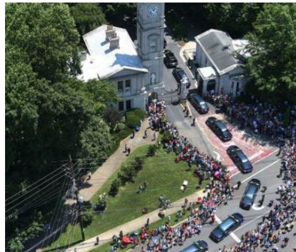
Muhammad Ali’s funeral procession entering Cave Hill Cemetery.