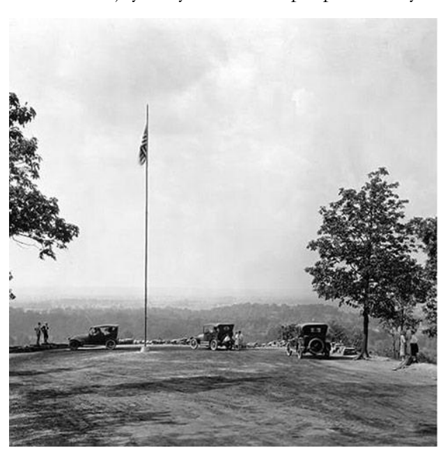
Lookout at Iroquois Park.