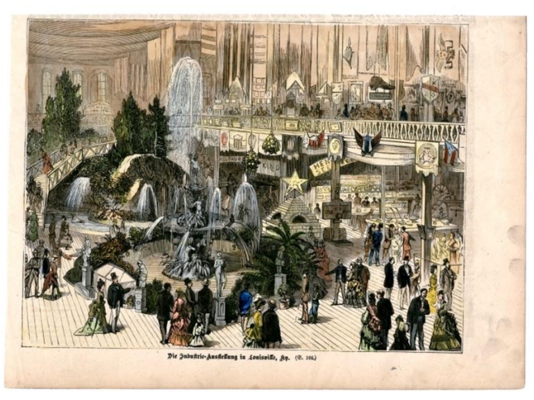
Color Rendering of Southern Exposition from German Newspaper. Wikipedia.

The Southern Exposition at Louisville could be described as the beginning of a new era. As business leaders gathered to discuss the idea, they set these goals: "to advance welfare of the producing classes of the South; to exhibit products and resources for the Southern States to the Northern and Eastern manufacturers and the implements and machines of the giant industries of the former." The ripple effects of